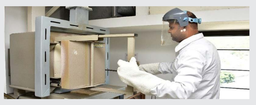
Demonstration of Touchstone testing in the Assay Laboratory.