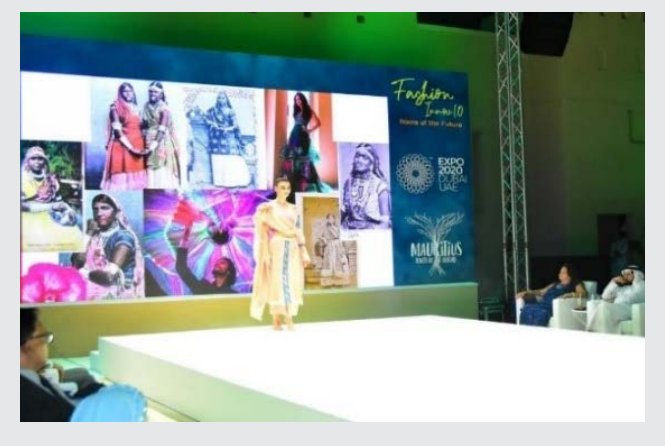
Indian Era Designs portrayed by students of FDI

On 16 March 2022, the Fashion and Design Institute (FDI), which falls under the aegis of the Ministry, organised its first Fashion Show in the Middle East, on the theme "Fashion Innov 1.0: Roots of the Future", jointly with the Economic Development Board at One and Only, Royal Mirage, Dubai.