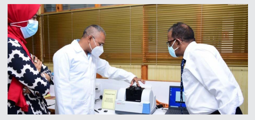
Demonstration of the DiamondCheck equipment to verify the authenticity of diamond in the Gemmology Laboratory

During the visit, it was highlighted that the Assay Office ensures the operation of the jewellery industry within the existing legal framework. The export of jewellery currently generates around Rs 4 billion for the country and this figure is bound to increase.