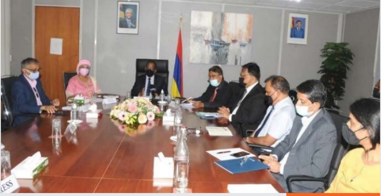
Snapshot of the press conference on the performance of EOE sector in 2021