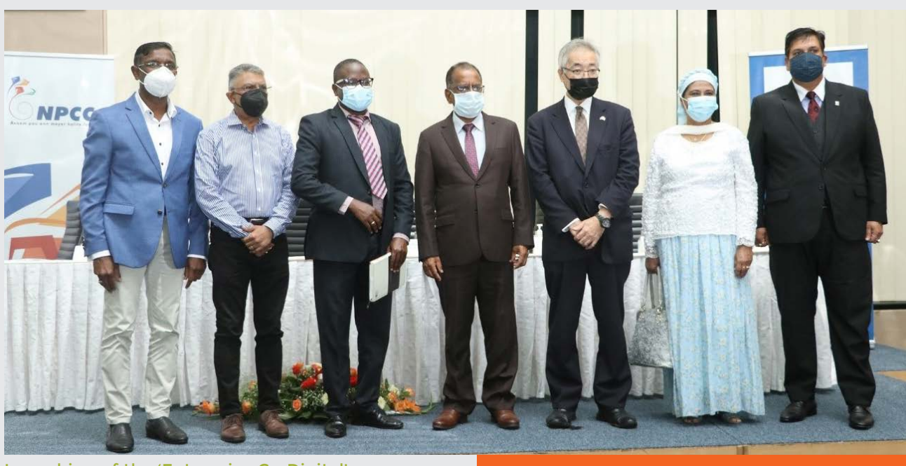
Launching of the 'Enterprise Go Digital' programme

The 'Enterprise Go Digital' programme was officially launched on Friday 4 March 2022 to increase productivity and strengthen the resilience of Small and Medium Enterprises (SMEs) through digitalisation and to keep up with the pace of technological change in the global economy.