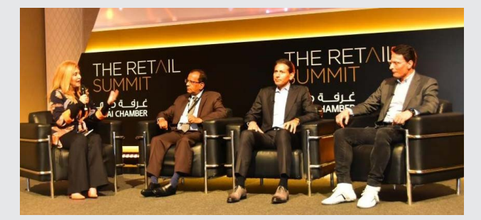
Panel Discussion, The Retail Summit, Atlantis The Palm, Dubai, 14 March 2022

The Retail Summit is a global event held annually to bring together players involved in international trade. This year's edition was held at Atlantis The Palm in Dubai from 14 to 15 March 2022. This event brings together approximately 800 business executives and speakers from around the world. The Deputy Prime Minister and Minister of Finance of Dubai, His Excellency, Sheikh Maktoum bin Mohammed bin Rashid Al Maktoum accompanied by a delegation was also present during one of the Plenary Sessions of the Retail Summit.