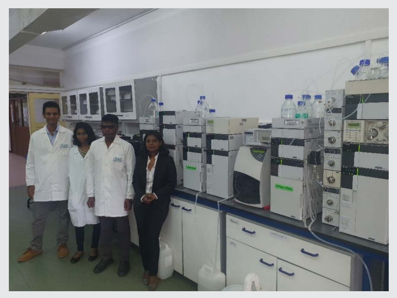
Staff of GAD in Food Testing field

On 27 April 2022, MAURITAS accredited the Government Analyst Division (GAD) of the Ministry of Health and Wellness in line with the requirements of "ISO/IEC 17025:2017 General Requirements for the Competence of Testing and Calibration Laboratories". GAD provides physico-chemical services for the analysis of food, pharmaceutical, alcoholic products pesticides, and cosmetics, amongst others.