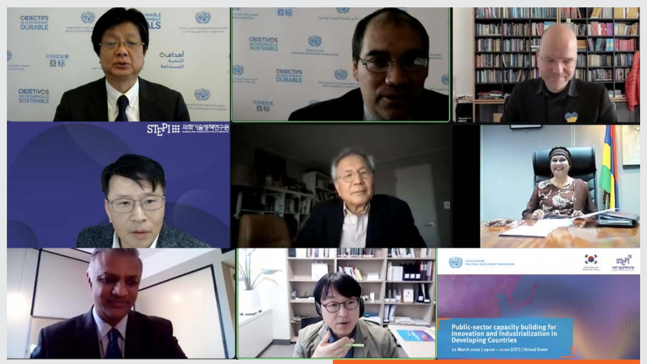
Participants in the Virtual Webinar, 22 March 2022

Following the launch of the Report, "The role of science, technology, and innovation policies in the industrialisation of developing countries: Lessons from East Asian Countries", the discussion addressed the importance of strengthening state capacities to promote STI. Speakers highlighted some of the principles for developing countries to successfully implement STI policies as drivers of industrialisation: