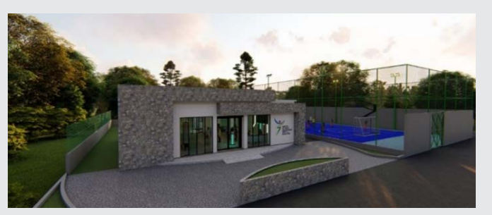
The new design proposal for the Mahebourg Centre de Jeunesse

The FDI was selected to design new youth hubs in Mahebourg, Souillac, Helvetia, Floreal, La Cure, Dockers Village, Goodlands and Montagne Blanche, through the preparation of an architectural, structural and M&E drawings as part of an action by the National Youth Council.