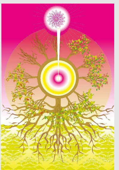
Artist: Geeta Devi Ramparsad Title of Work: Emergence of the soul Medium/technique: Mixed -media