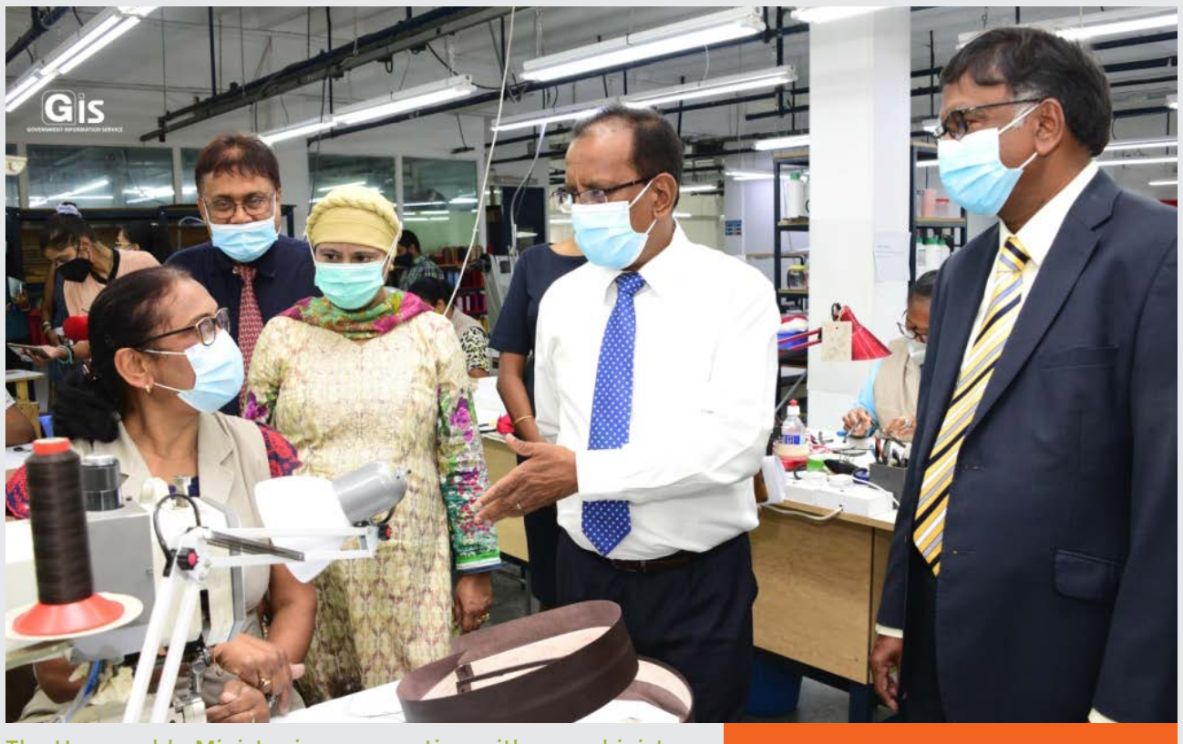
The Honourable Minister in conversation with a machinist

The Honourable Minister Soomilduth Bholah, visited enterprises at Leather Land, an industrial building situated at Riche Terre on 24 November 2021. Leather Land comprises three companies, namely Filao Ltée, Cover Tech International Ltd and Longchamp Mauritius Ltd, manufacturing luxury leather goods for exports.