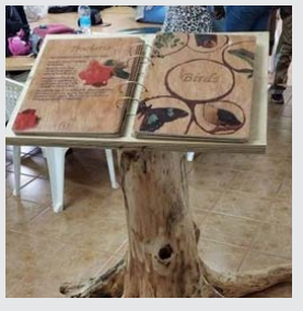
Woodwork and mural projects at Le Petrin Information Centre