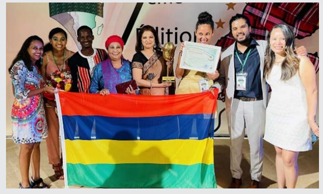
Mauritius: First prize winner for Best Stylist during the "Nuit du Coton"

Mauritius was selected out of thirty-two participating African countries and won the first prize as the Best Stylist during the "Nuit du Coton", defined as the culminating event of every SITA Edition. More info on the event at the website: https://sita.bf/