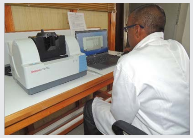
Staff of Assay Office operating the DiamondCheck equipment

In line with its mandate, the Assay Office of this Ministry has carried out for the period 01 July 2021 to 28 September 2021 the verification of 97 gemstones. The results are as shown: -