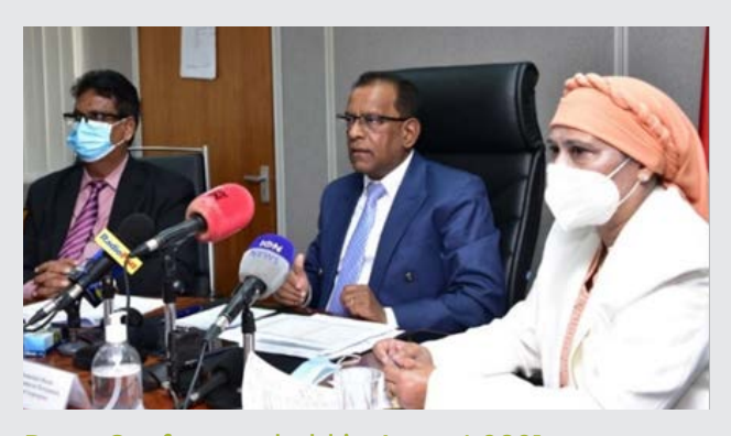
Press Conference held in August 2021

The Minister highlighted that this has been possible due to the resilience of the operators and the regular meetings with relevant industry stakeholders. Furthermore, he reiterated that Government continues to foster the right environment and provide the necessary incentives and packages to improve the business climate.