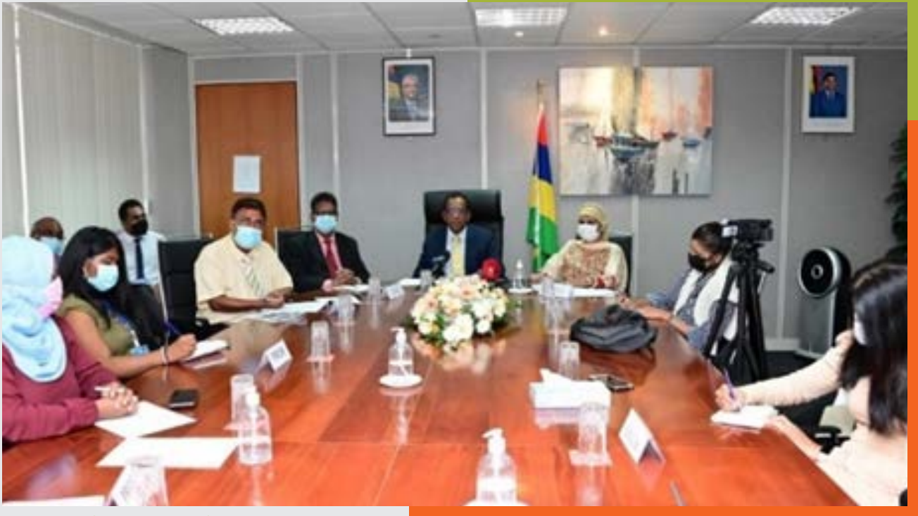
Press Conference held in November 2021