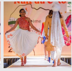
Students of the Fashion and Design Institute presenting their collection in SITA fashion show