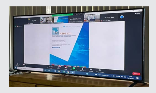
UNECA High-level Discussion Video Conference

During her intervention, the Permanent Secretary provided an overview of the manufacturing sector in Mauritius with emphasis on its industrialisation journey. She then elaborated on the challenges and impact of the COVID-19 pandemic on the manufacturing sector and shared with the other panelists, the policies and strategies of the Ministry to promote industrial development.