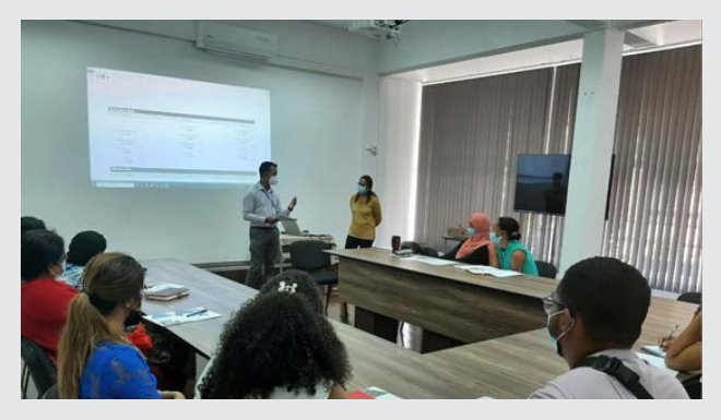
Students attending Creative Fashion / Textiles Design & Entrepreneurship class

The Creative Fashion / Textiles Design & Entrepreneurship course is designed to train unemployed people in view of developing their creativity and thus enabling them to become self-employed. The outline of this course is designed to create awareness of the role of clothing, textiles, and fashion in daily lives. The modules have been developed for the participant who has the desire to learn to sew and/ or design clothing and textile products.